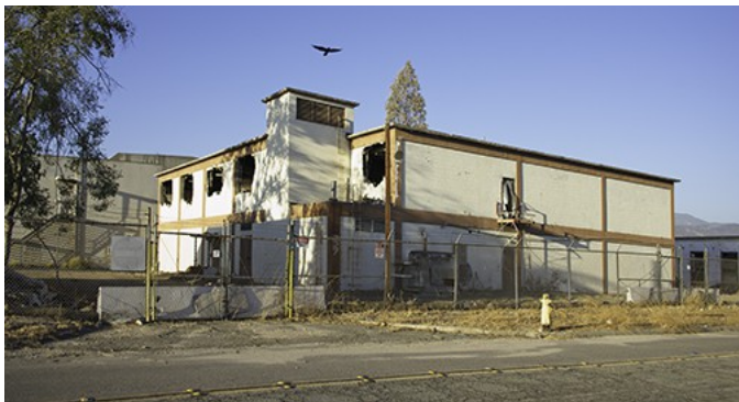
Building 227 now has temporary picture windows.