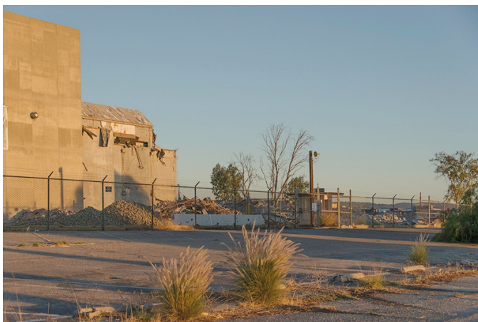
Building 227 is gone.