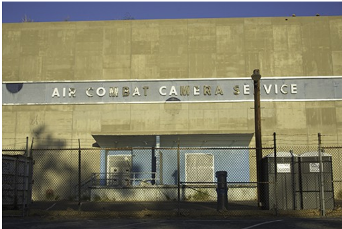
The shields are gone.